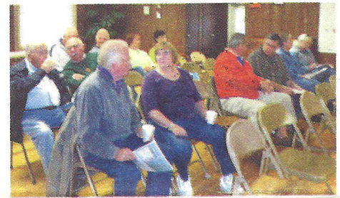
Foundation Supporters at the Annual Meeting