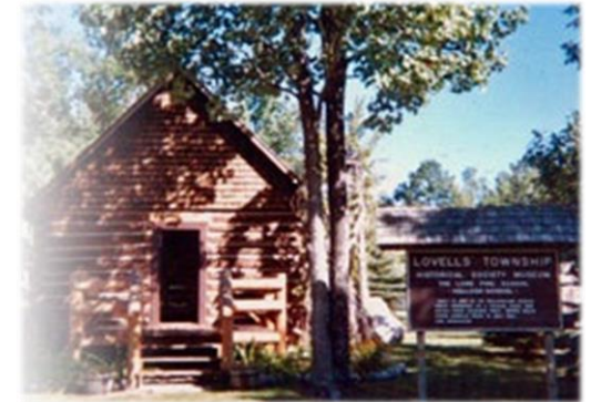
Lone Pine School House built in 1906

Houses the genealogical history of the pioneering families of Lovells learn about life in the 1900's on the North Branch.